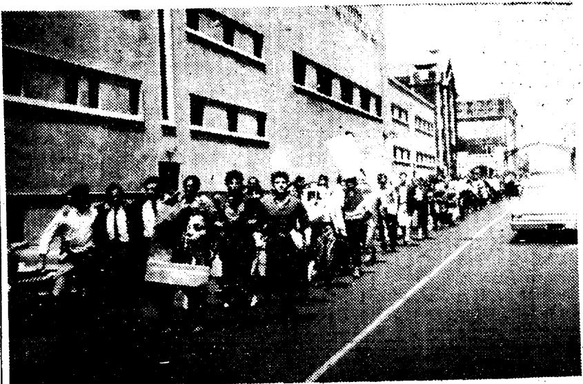
Students from the College participated in a neighborhood demonstration last May to install a traffic light at 135th St. and 5th Avenue.

President Gallagher was reported The two schools are already linked